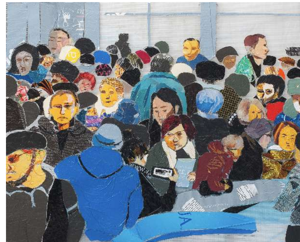
Civil Registration Service #3